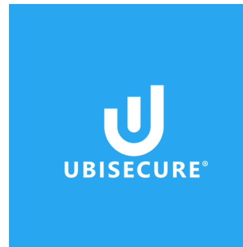
UBISECURE BLUE BACKGROUND

On Ubisecure Blue backgrounds, both the logo elements should be inverted to white.